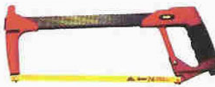
LD0340 Square Tubular Hacksaw Frame With Aluminium Handle