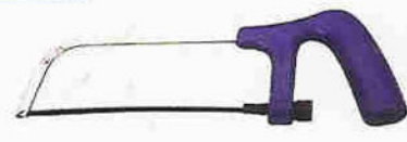
LD0344 Junior Hacksaw Frame With Plastic Handle