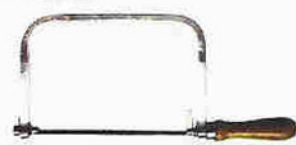
LD0346 Fall Rotary Wire Saw Frame With Wooden Handle