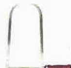
LD0345 Fall Frot Saw Frame With Wooden Handle