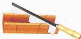
LD0329 Tenon Saw With Tank