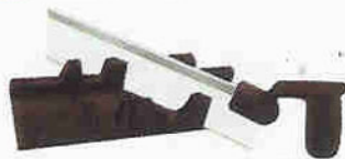
LD0330 Tenon Saw With Tank